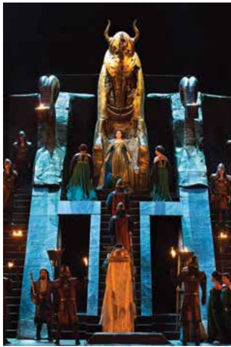
Abagaille at the altar of Baal in Nabucco

The Four Seasons Opera Club is proud to present Giuseppe Verdi's Nabucco Friday, Oct. 11 at 6 pm in The Lodge Theater. Nabucco is modeled after the Babylonian king, Nebuchadnezzar. The action is focused on the Nabucco's story arc movement from powerful king to deposed king due to madness from a lightning strike from God for his hubris, to his conversion to Judaism and return to sanity and kingdom. Interwoven is a love/power triangle of his daughter, Fenena, with the nephew of the King of Jerusalem, Ismaele, and Abagaille, Nabucco's non-royal daughter. By contrast, the prophet Jeremiah's tale turns upon God punishing the Jews for idolatry with the destruction of the Temple of Solomon, their banishment from Jerusalem, captivity in Babylon, and the eventual return of a chastised and more pious people.